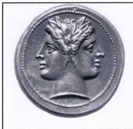
Janus Head, Roman God (100 B.C.)